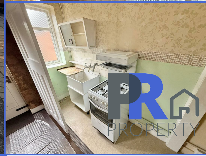
30 Hazelwood Close, Luton, LU2 8AR £230,000